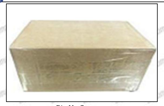
Pic No.2 Domestic express packaging: Wrapped by Transparent tape